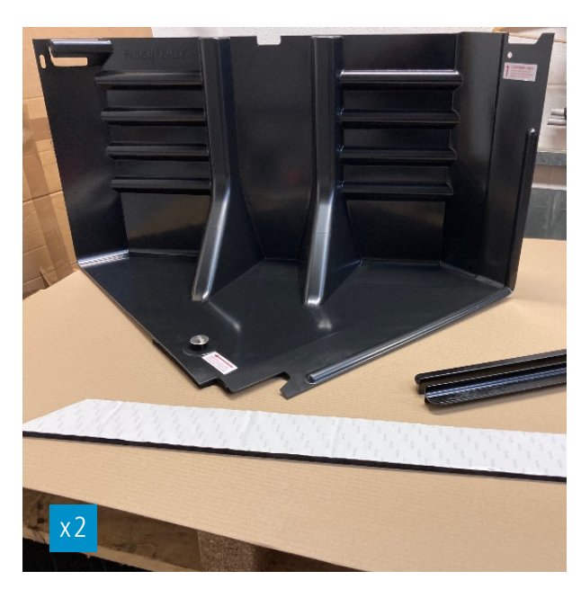
1. To deploy an Outer Corner – 2 x Inner corners (2 x PLSE316), and a Jointing Pin with 2 Gaskets, are required (1 x PLSE318).