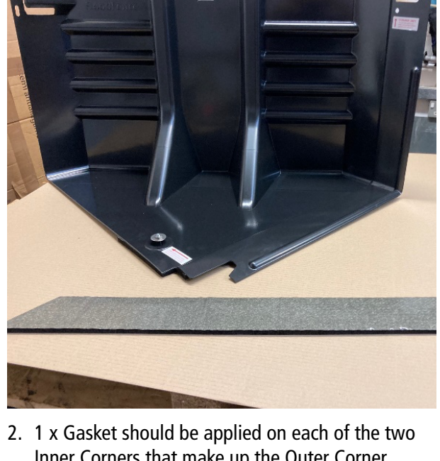
Inner Corners that make up the Outer Corner. Remove adhesive backing from the Gasket.