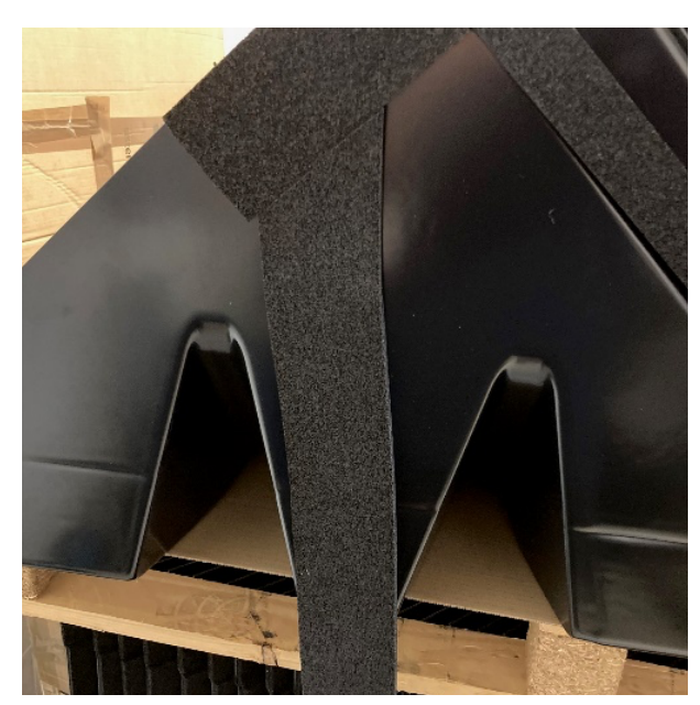
3. Apply the Gasket down the centre of the Inner Corner, aligning the angled end with the Gasket already in place along the edge of the Inner Corner.