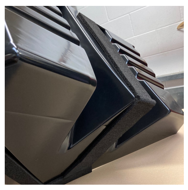
4. Fold the Gasket over the edge, and continue to apply along opposite side of Inner Corner.