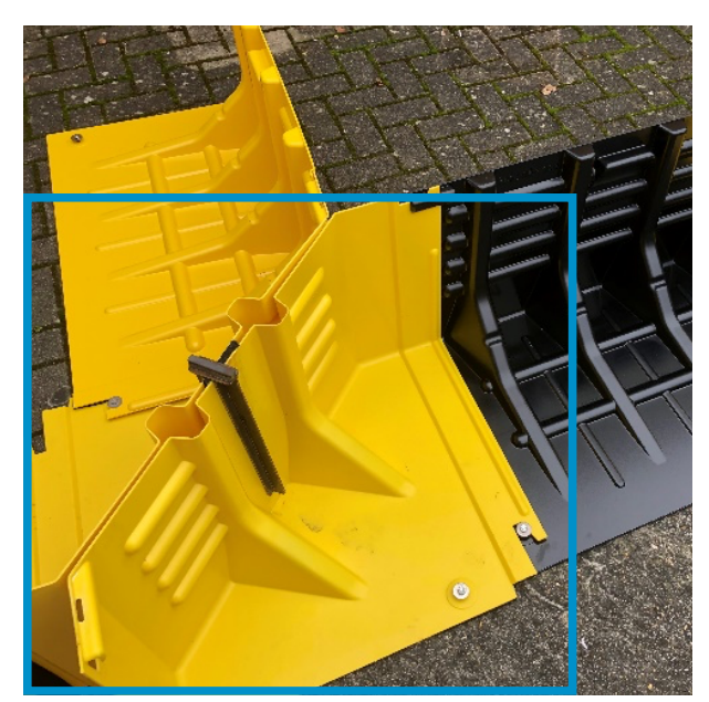
6. Two Inner Corners are then deployed back to back, with the Jointing Pin positioned to compress the Gaskets against each other, thus creating an Outer Corner.